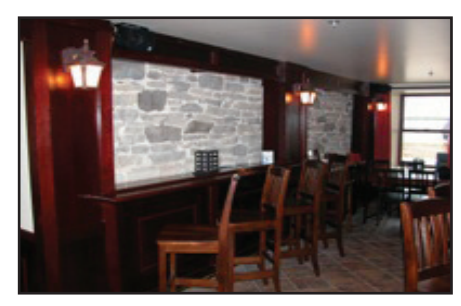
Unused office space was converted to a pub. at The Red George.