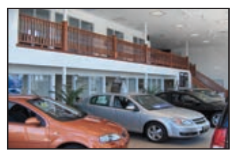
This mezzanine at Upper Canada Motors is used for additional office space.

Adding a new loading dock can improve the traffic flow in an existing building.